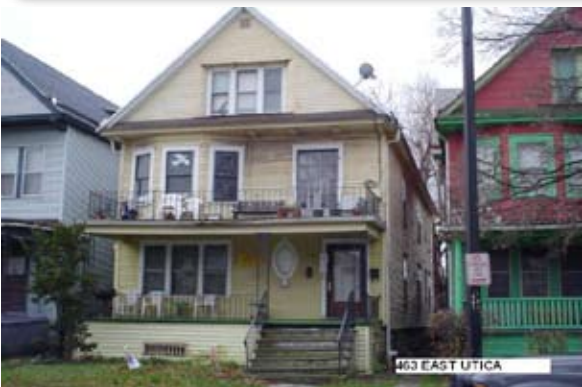
463 East Utica

369 East Utica Single Family Sq. Footage: 1520 Built: 1920 Lot Size: 30' x 142' Stories: 1.5 Heat: Hot air Bathrooms: 1 Basement: Slab/pier Bedrooms: 4 Covered porch Composition exterior Detached garage OCCUPIED