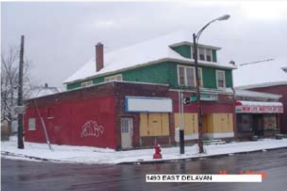
1493 East Delavan

3241 Bailey COMMERCIAL Row Retail 2 External Apartments Built: 1930 Lot Size: 30'x 117' Stories: 2 Sq. footage: 2400