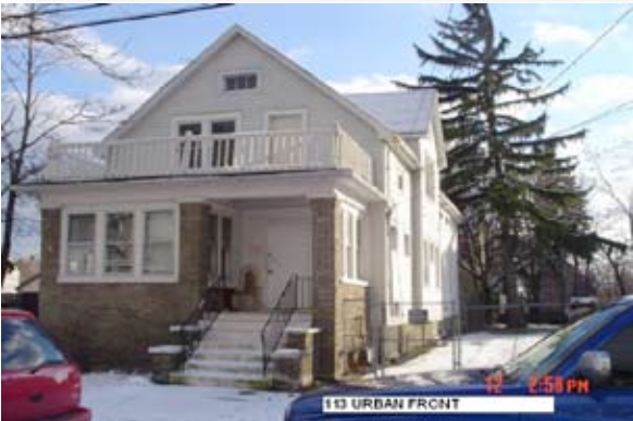
113 Urban FRONT BLDG.

483 TONAWANDA Single Family Sq. Footage: 1263 Built: 1920 Lot Size: 31' x 115' Stories: 1.5 Heat: Forced air Bathrooms: 1 Basement: Crawl Bedrooms: 3 Composition exterior Detached garage SALE PENDING HOMESTEAD ELIGIBLE