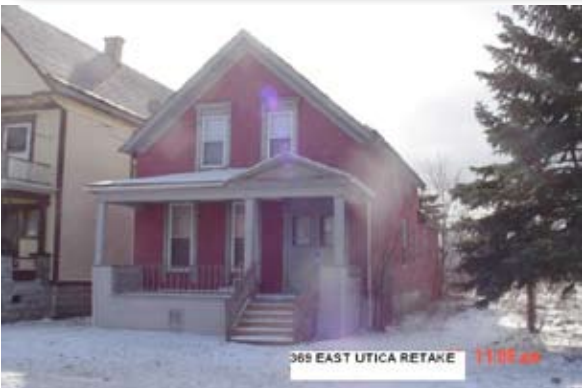
369 East Utica

113 Urban Front Building Sq. Footage: 2074 Built: 1920 Lot Size: 32' x 171' Stories: 1.5 Heat: Steam Bathrooms: 3 Basement: Full Bedrooms: 6 Covered porch Alum/vinyl exterior SALE PENDING