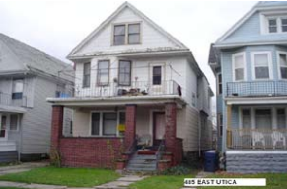
485 East Utica