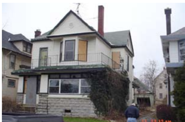
64 North Parade

64 North Parade Two Family Built: 1900 Stories: 2 Bathrooms: 2 Bedrooms: 6 Fireplace Alum / vinyl exterior Sq. Footage: 3368 Lot Size: 42'x142' Heat: Hot air Basement: Full Enclosed porch Detached garage SALE PENDING